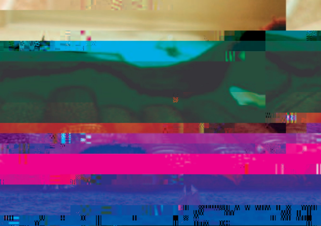
Going Places Sitting Down, 2005 Still from three-channel video projection with sound 8:40 loop, edition of 6 Commissioned by the Hayward/Bloomberg Artists' Commission